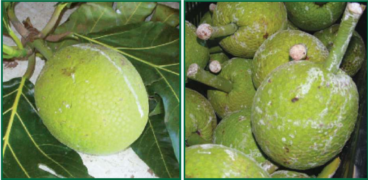
Figure 12a: Sap as an indicator of maturity; 12b: Unsightly sap oozing from the stem

problem (Fig. 12a). Sap may ooze in copious amounts from the stem after the fruit has been picked or from abrasions on the skin causing unsightly discoloration of the fruit which is considered a marketing problem (Fig. 12b). Nature's Way Cooperative Manual describes a relatively simple method for managing the effect of sap on harvested breadfruit.