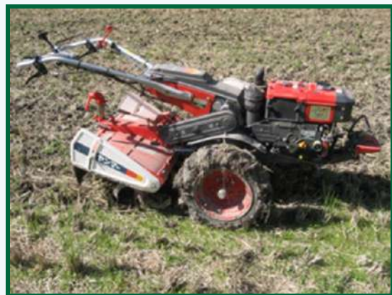
Figure 3: Two-wheeled tractor for improving overall efficiency