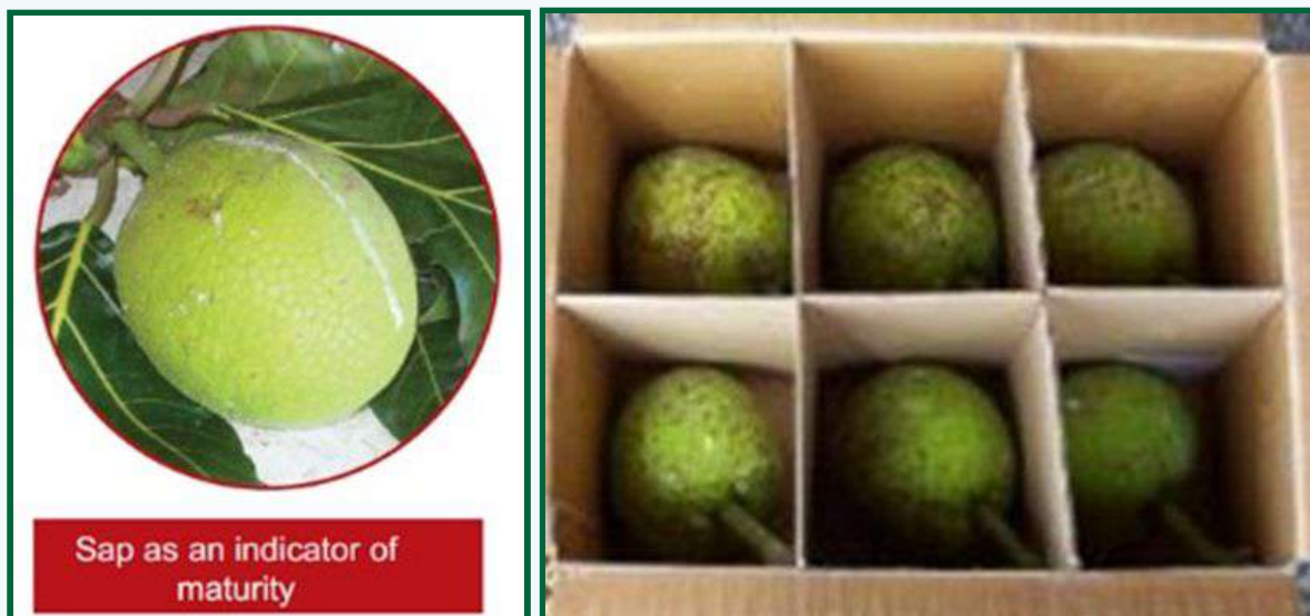
Figure 9: Sap as an indicator of maturity and sufficiently ripe Uto dina fruit being packed ready for export following HTFA quarantine treatment

The grower must rely upon a combination of visual cues, such as skin colour (deep-green to lighter green or yellow-green), scabbing on and around fruit sections and skin texture changes to determine when the breadfruit is mature. Natural cracks in the skin also begin dripping sap (Fig. 9). The Breadfruit Production and Agroforestry Guides provide a description of fruit development with photos and also fruit maturity indicators for the Ma’afala variety. Nature’s Way Manual describes fruit maturity and harvesting in the Fiji situation. Breadfruit at the stage of maturity desired for home consumption cannot be expected to last more than two days in the warm conditions of Fiji. For export, breadfruit has to be harvested at slightly less than full maturity which is described as mature green.