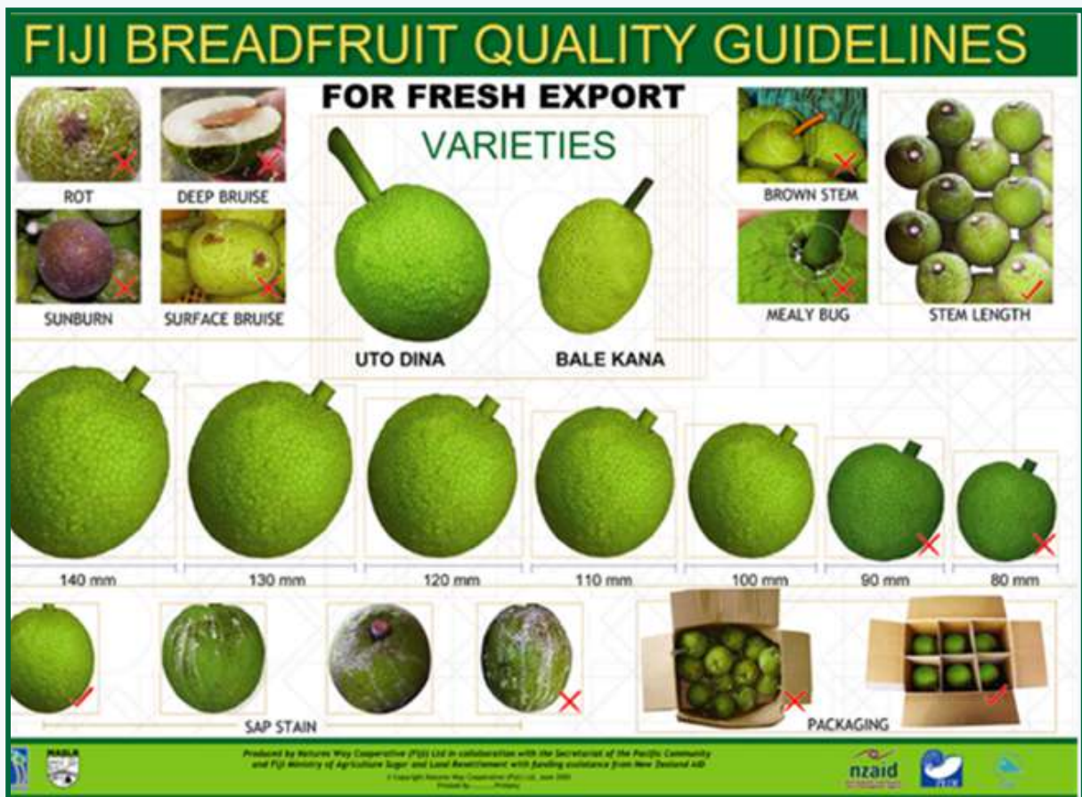
Figure 14: Fiji breadfruit quality guidelines

The transition from firm to soft breadfruit happens quickly (sometimes in a matter of hours). If softening happens when breadfruit is still with the wholesaler or retailer, claims for compensation can be expected against the exporters and future orders may be curtailed. To minimize the risk of fruit softening in the market, growers and exporters need to closely follow the recommended guidelines for breadfruit production and export. These guidelines are presented in the Fiji Breadfruit Quality Guidelines (Fig. 14) produced by Nature's Way Cooperative, who operates Fiji's HTFA.