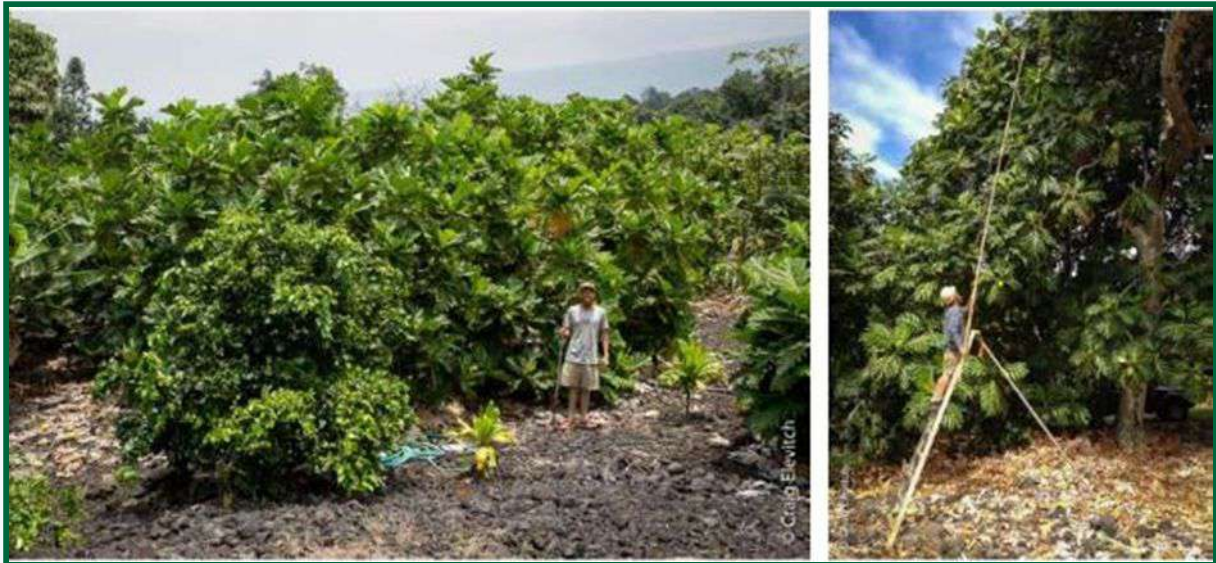
Figure 4: Pruned trees (left) can be efficiently & cost-effectively harvested. An unpruned tree (right) often requires 2-3 x more time to safely pick without climbing the tree or dropping fruit on the ground making it impractical for commercial purposes.

Pacific Agribusiness Research in Development Initiative Phase 2