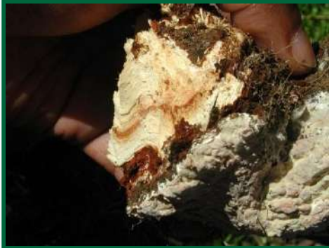
Figure 6b: Brown stem rot

Pacific Agribusiness Research in Development Initiative Phase 2