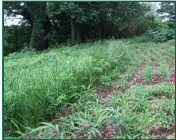
Figure 2b: Vetiver grass planted along contours