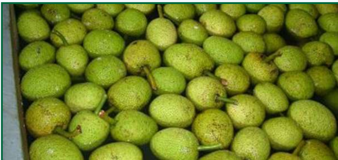
Figure 13: Breadfruit held in cool water bath to extend shelf life (Mahen's Exports, Sigatoka Valley Fiji)

As green mature fruit will usually ripen and soften within 1-3 days, room temperature storage is the least preferred method. Freshly harvested fruit that is fully submerged in cool, clean fresh water can maintain quality for several days or longer (Fig. 13). Refrigeration can also increase shelf life with the optimum temperature range being 12-16°C. At these temperatures, a shelf life of 10 days is possible and can be extended to 14 days if the fruit is wrapped in plastic. Below 12°C the skin will turn brown.