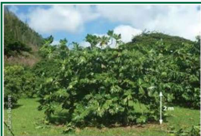
Figure 5c: A pruning height of 4.5-5.5m is recommended. Prune back to the same height each year. You can seek professional advice if you feel it is needed.