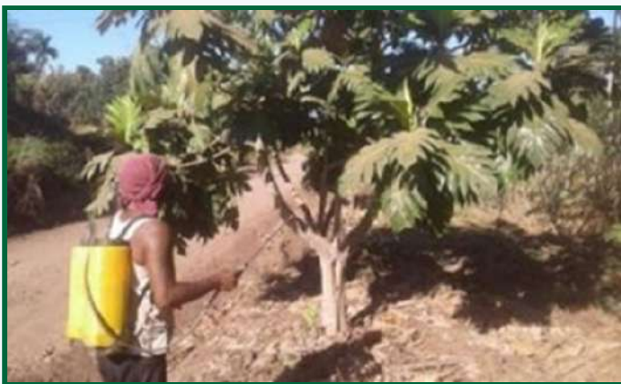
Figure 7: Bait spraying breadfruit prior to HTFA treatment (Sahn Ali orchard Buabua, Lautoka, Fiji)

HTFA treated breadfruit sourced from bait sprayed orchards is permitted for export to New Zealand. It is expected that a similar export pathway will soon be in place for the Australian and USA markets. For fresh export all care must be taken to ensure that bait spray procedures are correctly followed together with the necessary field sanitation measures.