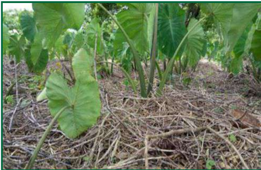
Figure 1: Mucuna bean that has dried off provides excellent dried mulch ground cover as illustrated here with taro

Mulch can be added at this stage or after planting. Mulching is an excellent practice for reducing soil erosion due to rainfall, holding in moisture, keeping the soil cool and reducing weed recruitment. Mulch is most effective if it lies directly in contact with the soil surface, so chopped or chipped organic material is preferable. Uncomposted organic materials should not be mixed into the soil immediately before planting, as the resulting organic activity in the soil [and binding on nitrogen (N)] will suppress plant growth. Planting a groundcover crop removes the need to add mulch. Figure 1 shows the planting of mucuna bean as a ground cover crop with taro. Mucuna improves soil fertility, improves taro yield, reduces weed numbers and improves soil biology.