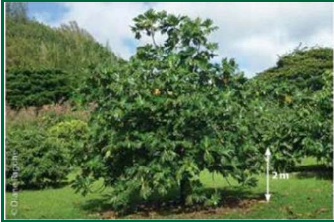
Figure 5a: For young trees, it is important to control vigorous shoots both from the top and sides. Crown reduction throughout the canopy – rather than only topping – is the best practice.