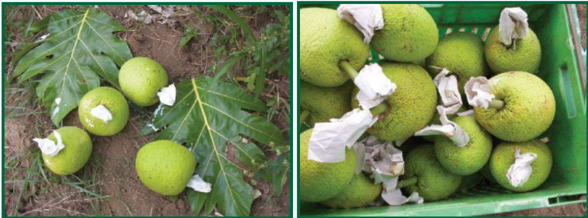
Figure 12c: Tissue-type paper wrapped around end of fruit stem; 12d: Fruit in crate with paper wad retained.

When the fruit is harvested it is held stem-down to prevent sap from dripping down the stem onto the surface of the fruit. A wad of tissue-type paper is wrapped around the end of