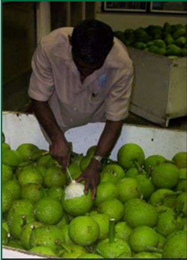
Figure 8: Breadfruit being probed for HTFA quarantine treatment at Nature's Way Cooperative Fiji

Pacific Agribusiness Research in Development Initiative Phase 2