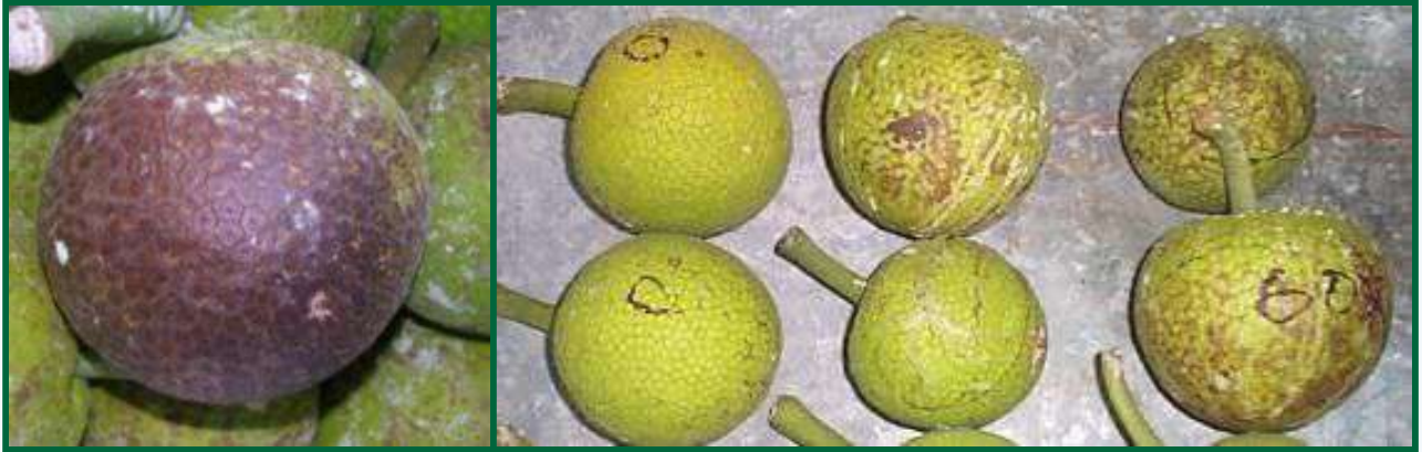
Figure 10: (a) no exposure to sun; (b) 30mins exposure to sun; (c) 60mins exposure to sun; (d) extreme sun burning

may be well suited to local food consumption or for livestock if unfit for human consumption).