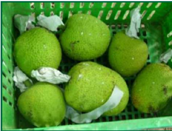
Figure 11 Plastic crate used for transporting breadfruit

Fruit must be kept in the shade as much as possible to avoid adding to field heat and sun burn damage. Harvesting fruit in the early morning hours helps to reduce field heat of harvested fruit. Figures 10a-d illustrate what happens when breadfruit are exposed to the sun for different lengths of time.