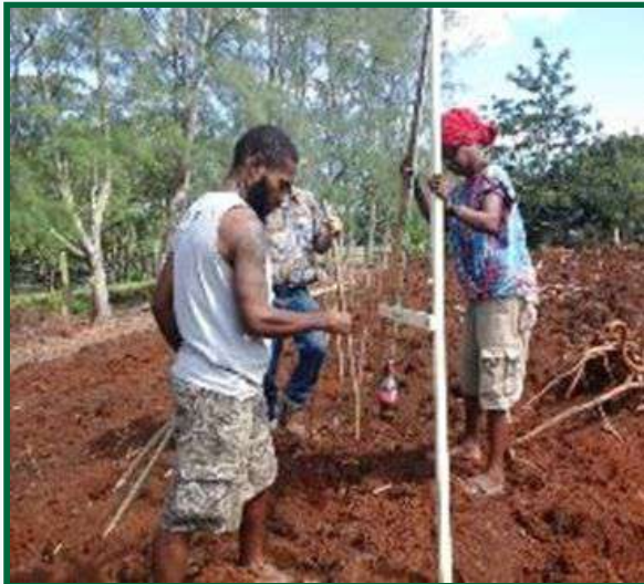
Figure 2a: Using an A-frame to determine contours for orchard establishment (Vanuatu)

If you are cultivating breadfruit on sloping land, then measures need to be taken to avoid soil erosion. These measures include: (a) planting vetiver grass along the contours using an A-frame to identify the location of the contours; and (b) if the slope is significant, using drop structures to improve drainage and minimise soil loss (Figs. 2a-c). A two-wheeled tractor can be used to improve labour efficiency when establishing your agroforestry orchard (Fig. 3).