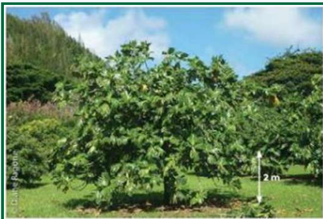
Figure 5b: The first pruning should be done as needed, usually by Year 3 or 4. Prune back to a strong branch union. Take care to remove aggressive shoots and co-dominant leaders. Prune only branches that need to be pruned to shape the tree to an even domed canopy.