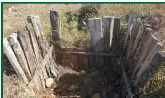
Figure 2c: A drop structure established in the drains at Tui's breadfruit orchard