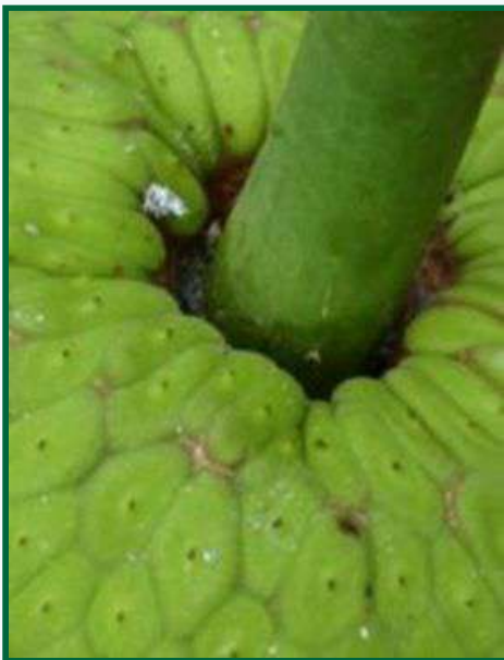
Figure 6c: XXX

Brown stem rot is a serious breadfruit disease, which in extreme situations can kill the tree. At present, no control measures are available. However, to minimize the risk of the disease spreading, trees should not be planted too closely.