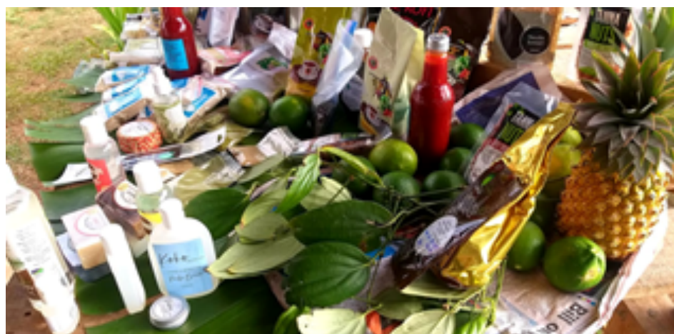
Part of the value-add products on display at the Value-Added Fair in Nadi, Fiji – Dec, 19

A total of 51 activities were undertaken in Component 1, with a total of 1305 participants of which there were 581 Males / 724 Females & 475 Youths for the Pacific.