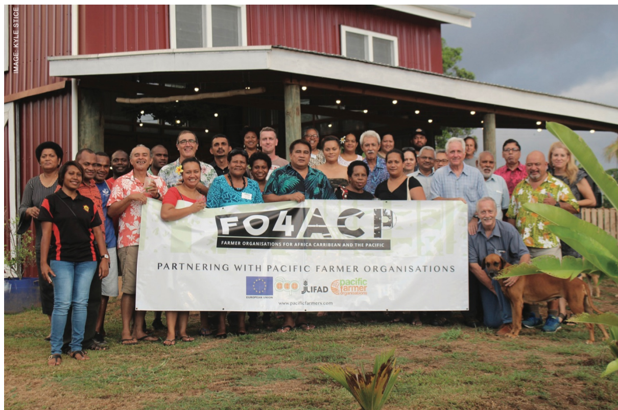
PIFON FO Members at its Regional Learning & Planning Workshop in Nadi, Fiji on December 2019

This Pacific Report 1 is the first extensive report of the FO4ACP implementation in the Pacific Region and covers the period of the project from its beginning of September 2019 to August 2020. We trust you will enjoy the journey with us.