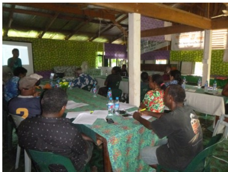
Farmer Leaders attending the Solomon's National Platform Meeting hosted by PIFON member KGA, in Honiara, Solomon Islands