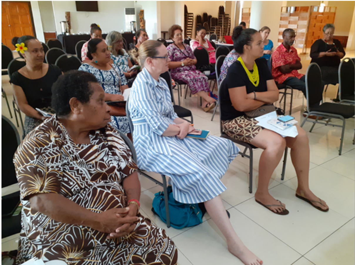
PIFON participants at the Women In Agriculture Regional workshop at the Tanoa Tusitala, Apia, Samoa – Oct 2019

This meant that FO4ACP activities could not be implemented because of the environment that 2020 ushered in. It has only just recently begun implementing ground activities in some of its countries.