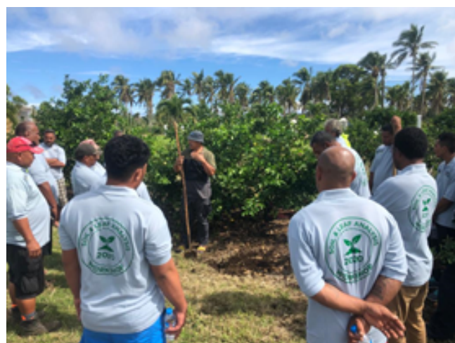
Component 1 activity by Nishi Trading, in Tonga conducting Soil & leaf analysis training at Nishi Farm – May, 20