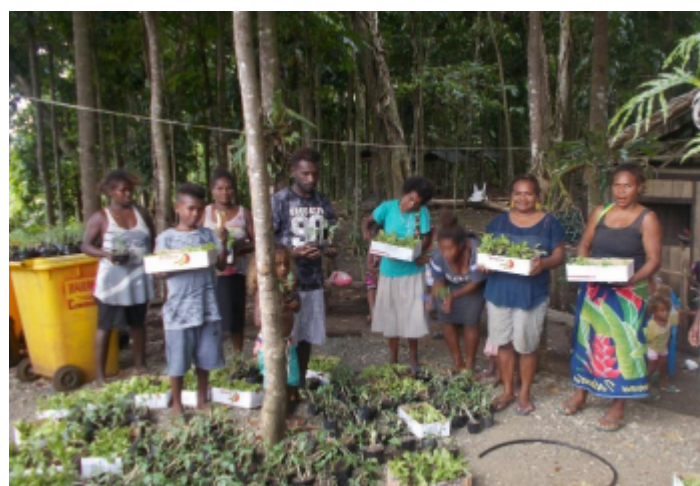
KGA Seed Production & Seedling Workshop