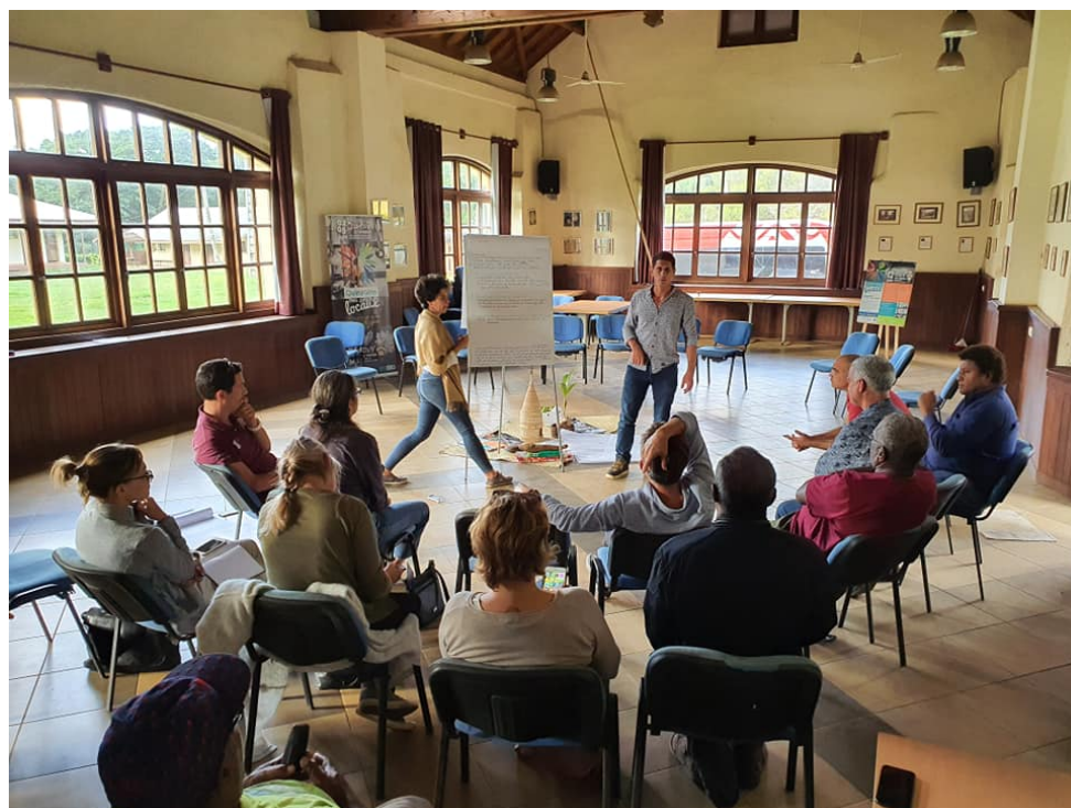
Members of New Caledonia's Chamber D'Agriculture during one of their field meetings with their farmers