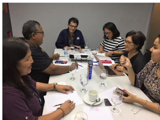
Asia Pacific Region Farmers Forum (APR FAFO) Steering Committee meet in Cebu, Philippines to prepare for upcoming Global Farmers Forum (FAFO) to be held in Rome, Italy in February 2020