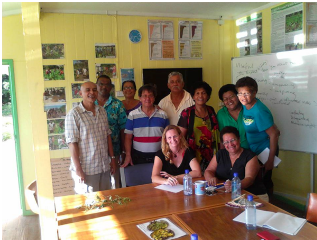
Members of Fiji's National Implementing Agency (NIA) Tei Tei Taveuni (TTT) pictured at their Resource Centre office in Waiyevo, Taveuni, on Fiji's second largest island, Vanua Levu. TTT's office was established under the MTCP2 project in partnership with the Ministry of Agriculture, Government of Fiji.

PIFON has simplified the FO4ACP project components into messaging for ease of relatability for its FO members and the network, this allows the message for FO4ACP to be easily adopted at grassroot because of the simplicity in its messaging.