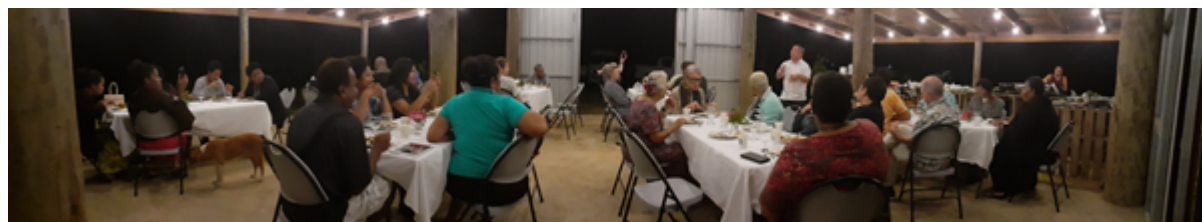
Participants of the Agribusiness Masterclass listening to Chef Lance Seeto during the evening session sharing about Tourism and how food is an integral part of storytelling in Tourism in the Culinary market, the Agribusiness Masterclass is a joint partnership between ACIAR/PARDI2 & PIFON.

Thirty-seven (37) activities were undertaken in Component 3, with a total of 384 participants of which there were 176 Males / 208 Females & 120 Youths for the Pacific.