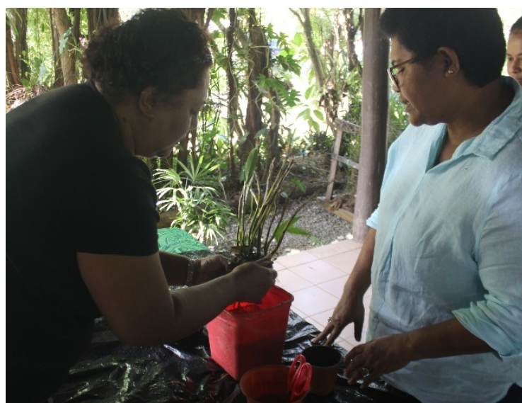
Participants attending to orchid care at the Orchid Care Workshop with South Sea Orchids and part of the Orchid plant distribution