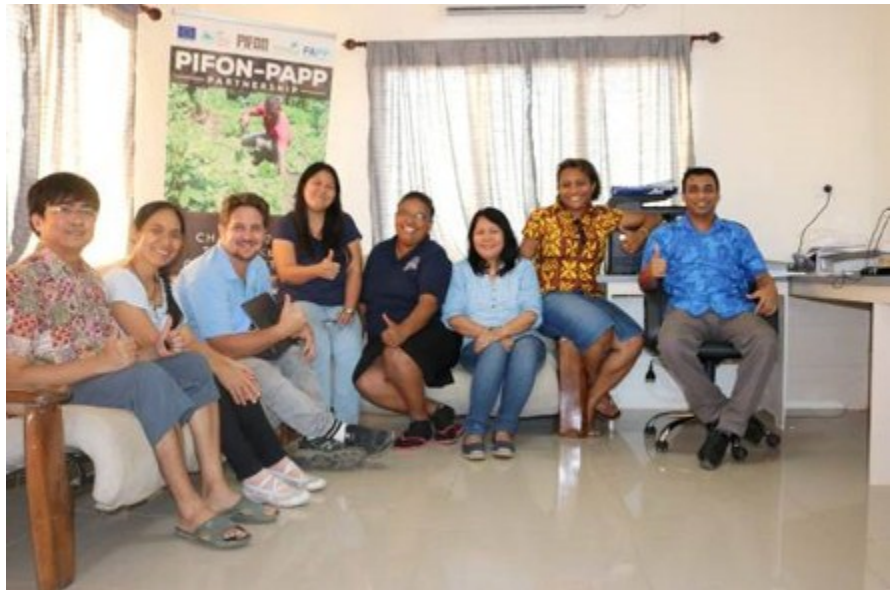
PIFON Secretariat staff with AFA staff at the PIFON office in Legalega, Nadi, Fiji

Topics covered in the three and a half day workshop included the review and adjustment of quantitative and qualitative targets, the 2017 work plan and budget and the review and upgrading of the PIFON M&E, Finance and Procurement Policy/Procedures and KM plan. The PIFON team are now in a better position to conduct training on KM, Finance and M&E at the Learning and Planning meeting in November.