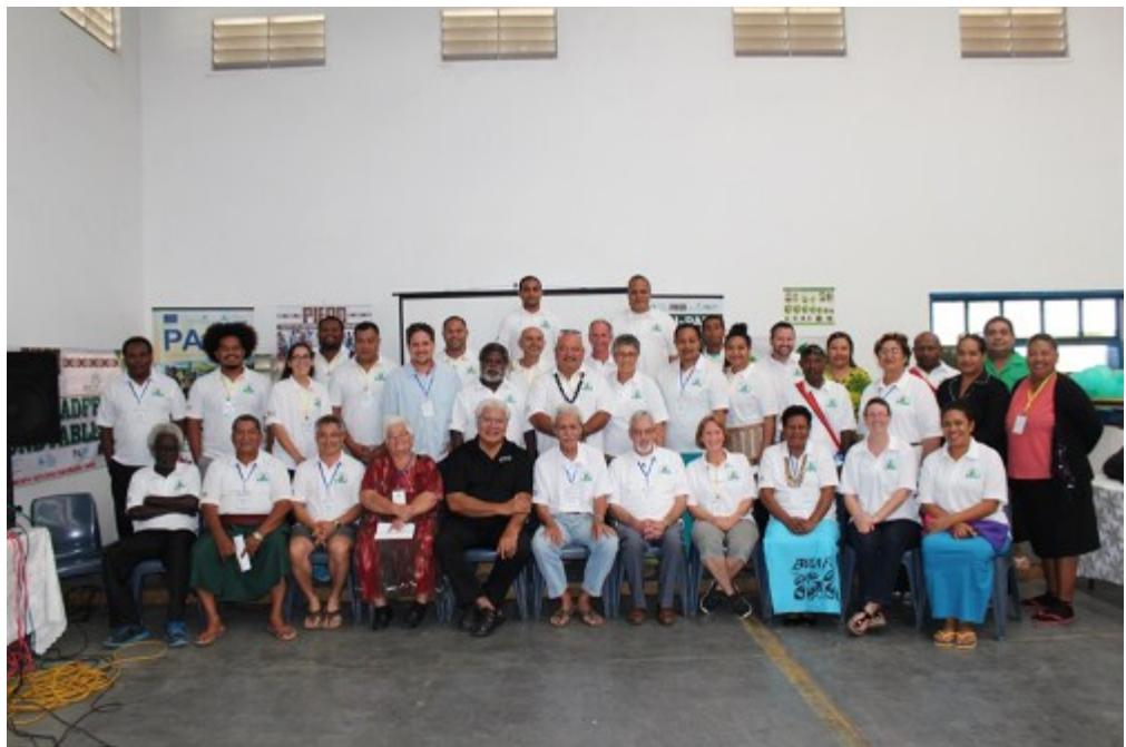
Participants to the Pacific Breadfruit Roundtable event pictured at Nishi Trading Packhouse, Utulau, Tonga

Proceedings from this roundtable will be released by PIFON in due course.