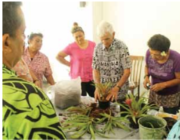
A floriculture technical exchange by SSO from Nadi, Fiji to SFA Apia, Samoa.