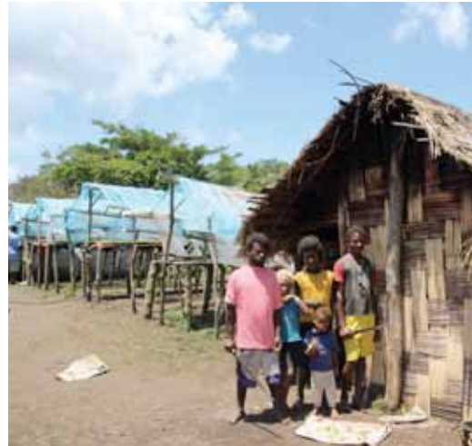
Participants at the Napil Rural Training Center on Tanna, Vanuatu.