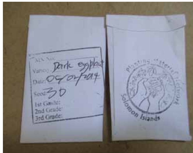
The Solomon Islands Planting Material Network located within Kastom Gaden Association has been supported to upgrade its seed production and storage facilities.