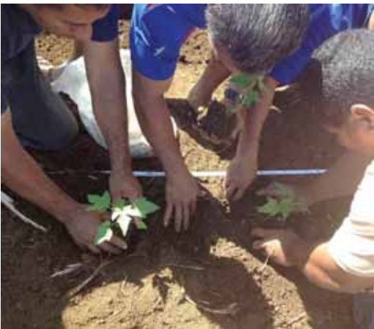
A farmer to farmer exchange between a papaya farmer/specialist from SOPA in Nadi, Fiji and farmers of SFA, Apia, Samoa

A technical exchange with South Sea Orchids (SSO) on floriculture has been completed. The training was conducted using the Fiji Floriculture Handbook that was launched in March 2014 in a bid to enhance the viability of floriculture businesses. Hands-on training on how to grow and harvest cut flower and flowering potted plant varieties such as anthuriums, orchids, guzmanias, gingers and heliconias was provided and also covering the aspect of managing a floriculture business