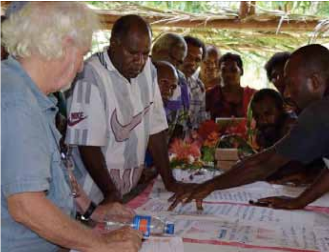
VC Training on Malo, Vanuatu for organic pepper farmers and producers/exporters